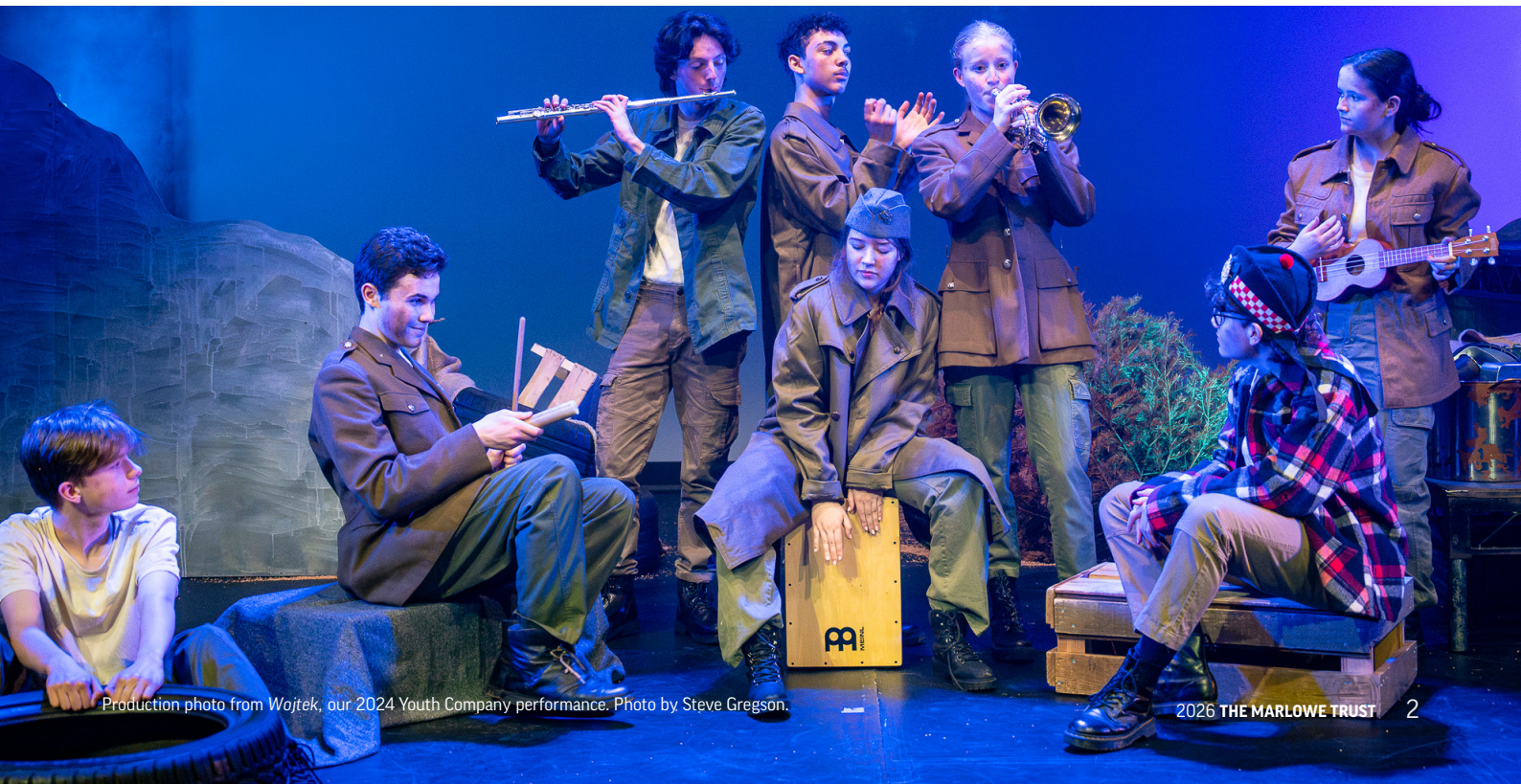
Production photo from Wojtek , our 2024 Youth Company performance.